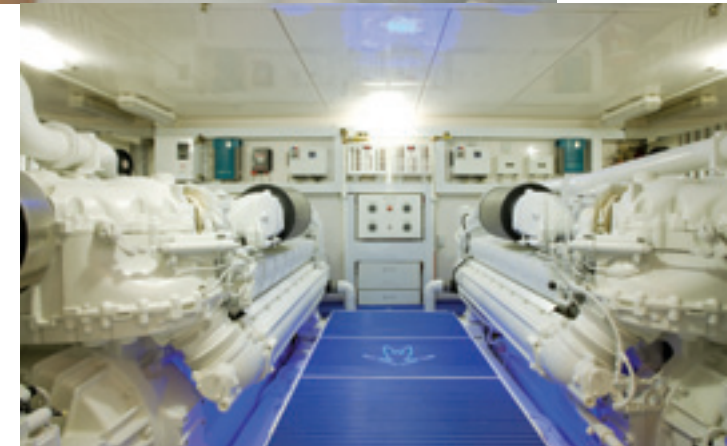
ABOVE: The upper deck, in the enclosed flybridge version, effectively is a second lounge area; Bertram offers three power options for the twin MTU 16v series 2000 engines