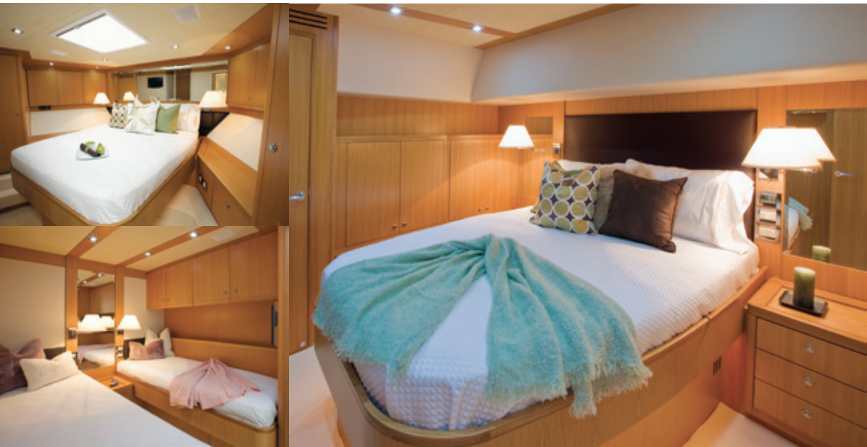
ABOVE: A nice VIP and two additional cabins, including a twin, are one of several possible layouts

in the bilge area between two 2,400 hp V-16 MTU diesels, help achieve stability. The bottom also incorporates shallow propeller pockets to help the boat maneuver in fishing situations. The yacht's top speed at three-quarters load is 36.5 knots, which gives it a 435-nm range at its 30-knot cruising speed. An optional upgrade to two 2,600-hp MTU diesel engines could add up to two more knots. There is only one 3,000-gallon fuel tank, located just forward of the engines, and with a 186 gph total fuel use at cruising speed, the boat can run up to 16 hours without a stop.